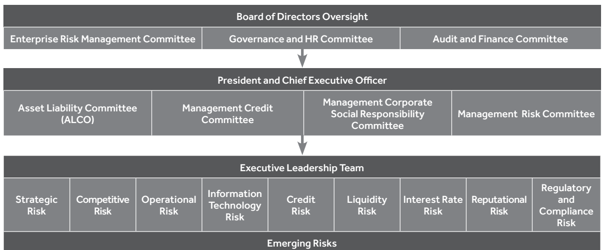
Figure 1: Servus Credit Union's Enterprise Risk Management Governance Model

The president and chief executive officer (CEO) is responsible and accountable for risk management. Day-to-day monitoring and reporting on risk has been delegated to the senior vice president of Risk and Audit. Four management committees — the Asset Liability Committee, the Management Credit Committee, the Management Corporate Social Responsibility Committee and the Management Risk Committee — identify, assess and monitor risks through their work. Ownership of key risks is delegated to the appropriate Executive Leadership Team member.