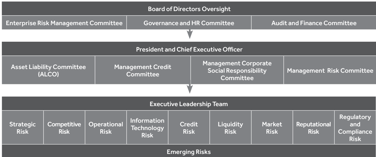
Figure 1: Servus Credit Union's Enterprise Risk Management Governance Model

Traditional risk management solutions tend to focus on negative events and often depend on diligent corporate compliance programs. Servus proactively elevates material risk issues to senior management and the board. This helps Servus find a better balance between loss prevention, risk mitigation efforts and entrepreneurial risk-taking.